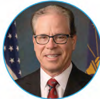
Mike Braun Governor of Indiana