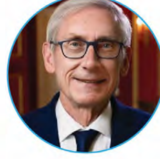
Tony Evers Governor of Wisconsin