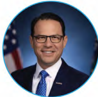
Josh Shapiro Governor of Pennsylvania