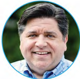
JB Pritzker Governor of Illinois