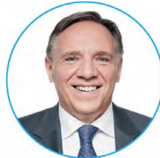
François Legault Premier of Québec