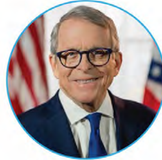
Mike DeWine Governor of Ohio Vice Chair