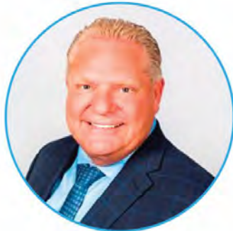
Doug Ford Premier of Ontario