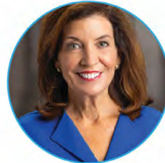
Kathy Hochul Governor of New York