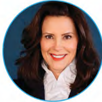
Gretchen Whitmer Governor of Michigan Chair