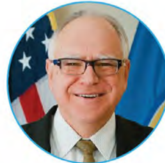
Tim Walz Governor of Minnesota