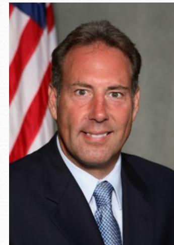
Senator Joseph Robach New York