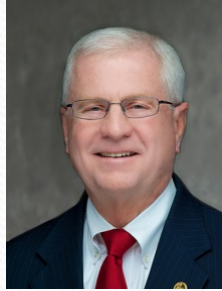
Senator Ed Charbonneau