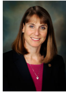
Senator Laura Fine Illinois