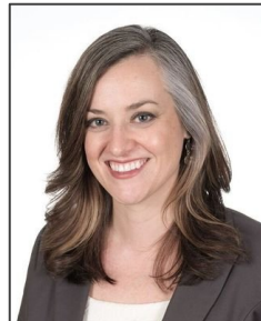
MPP Jennifer French Ontario